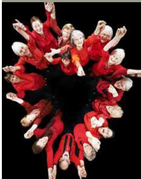
CoisCéim's Love Song and Dance

MINISTRY OF EDUCATION AND CULTURE CULTURAL SERVICES