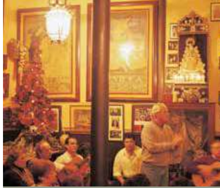
Music in Seville's Casa Anselma