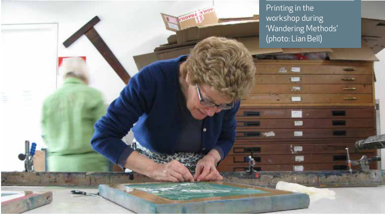
Printing in the workshop during 'Wandering Methods'

'Wandering Methods' is about taking time to explore a historic building and to develop craft skills and make artworks inspired by its memories, stories and architecture.