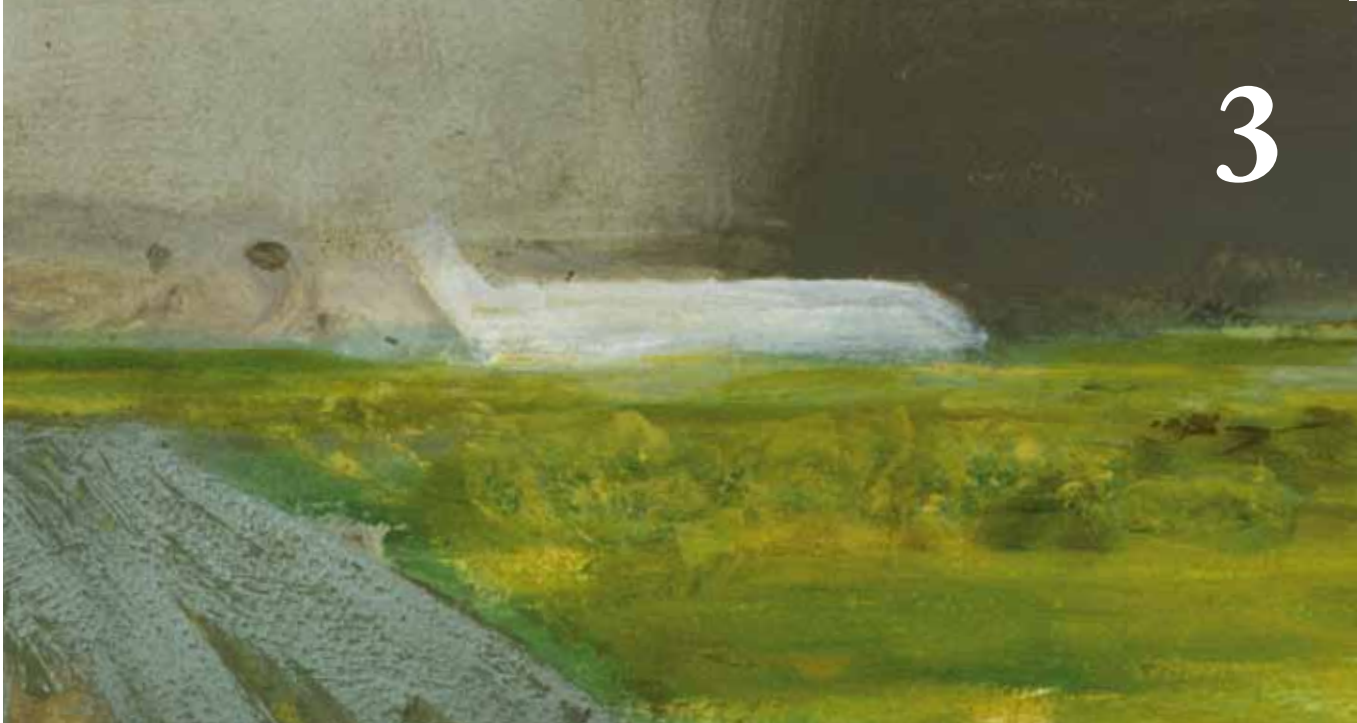
Detail from 'Storm at Shannon' by Camille Souter