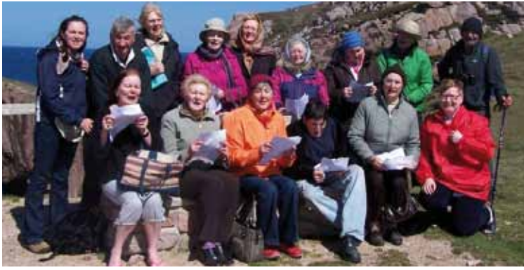
Left: Cumann Cairdeas members on a Singing Picnic to Gola Island Right: Silver Stars Rehearsal