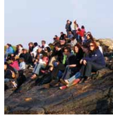
Left and centre: Dawn Chorus choir Right: Enjoying the music on Culdaff Beach