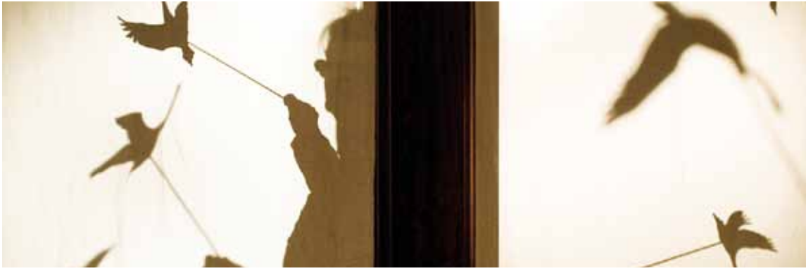
From the 'Swans' project at the Abbey Theatre