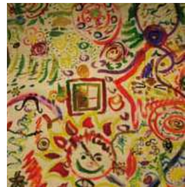
Left: National Grandparents' Day in School