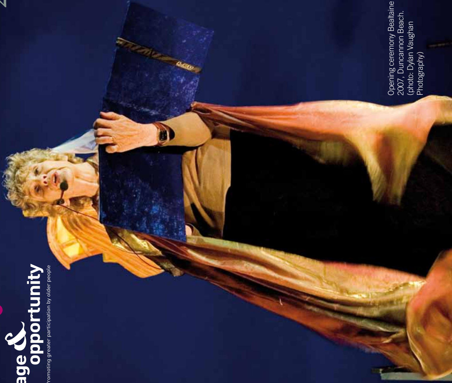
Opening ceremony Bealtaine 2007, Duncannon Beach.