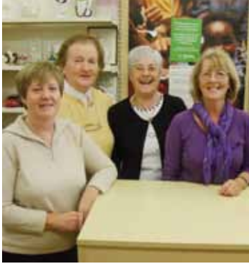
Left: Oxfam Volunteers