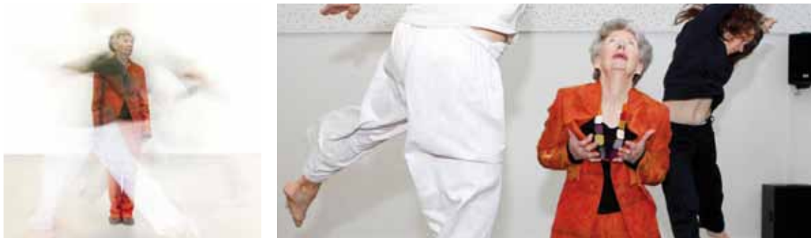
From the Macushla Dance Club/Ciotóg performance, 'Tipping Point'

Transport to and from events can be an issue for some groups. To help with this, Wicklow County Council are creating a 'Go See Fund' for Bealtaine this year. Groups can apply for assistance to get to arts events in the Courthouse Arts Centre in Tinahely or the Mermaid Arts Centre. The fund will also cover travel to cultural institutions in Dublin or funding an arts practitioner to run a Bealtaine event. For Wicklow , call 0404 20 155 to find out more.