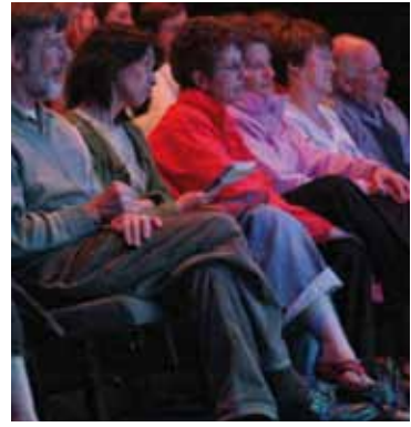
Left: Still from Dean Spanley