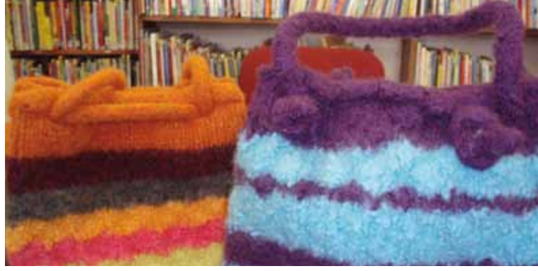
Right: Bags of craft