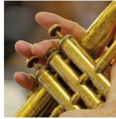
Opposite and left: 'Blow the Dust' orchestra members Right: 'Blow The Dust' rehearsal