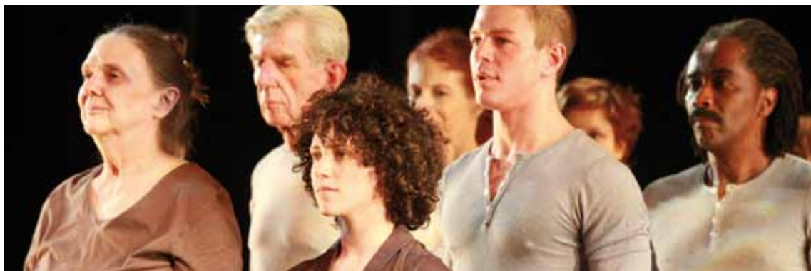
Liz Lerman Dance Exchange, Portlaoise

'Hearth - Art for Older People at Home' is a new initiative that brings experienced artists to work with people in their own homes. 'Hearth' artists bring materials, encouragement and mentoring to each home, shaping the experience to suit the person they're working with. Some of the artwork already created will be displayed at the launch in the Ballina Arts Centre.