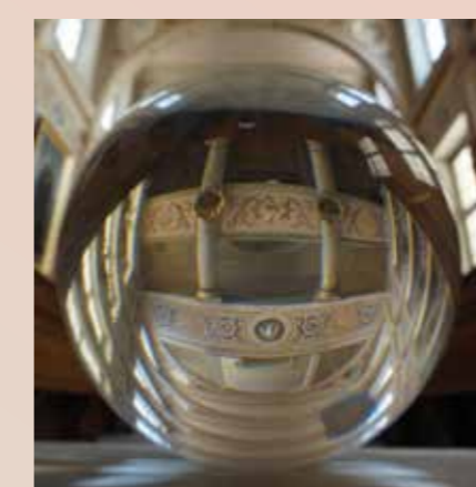
Tina O'Connell sculpture, 2013