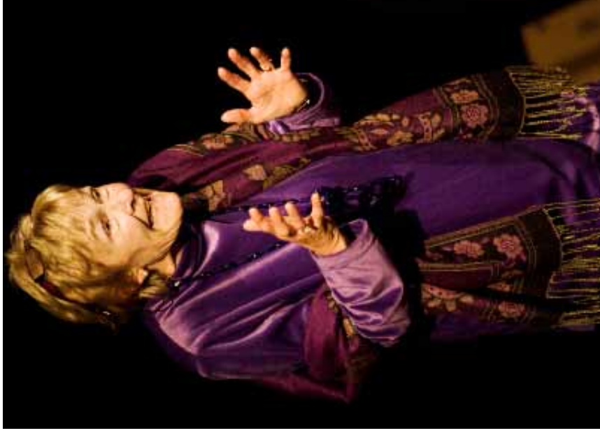
From the 'Swans' project at the Abbey Theatre