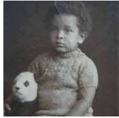
Left: Image from Skuggar (Shadows)