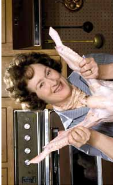
Left: Still from 'Julie & Julia'